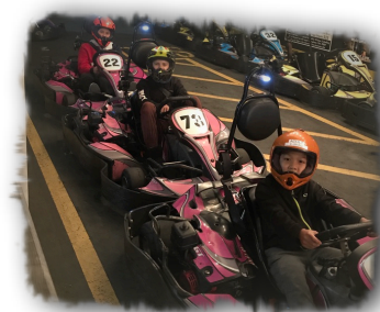
Go karting day as part of our summer day camp program. July 2021