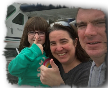
Lochhead family trip to Vancouver before we all return to school and work full time. August 2021