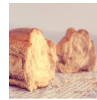
Table to Table: Breakfast & Communion Sunday

Sign up today to consider life's biggest questions! Weekly dinner and discussion runs Sundays 4:45pm-7pm, Jan. 13 to Mar. 31. Invites and more info at the Welcome Centre.